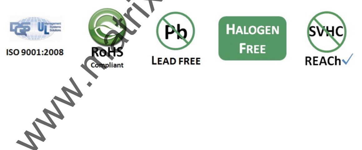
AXAREL is a registered trademark of Vantage Specialties, Inc.

36 months when stored in original, sealed container above 50 °F (10 °C).